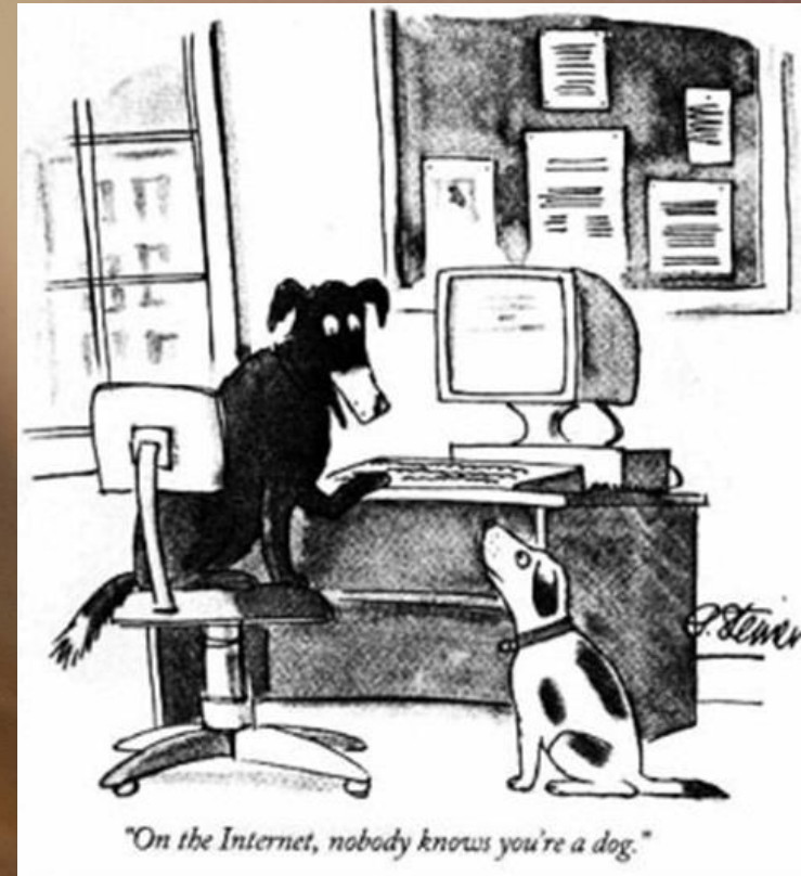
The New Yorker